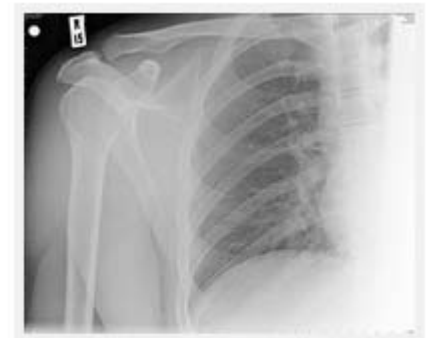
X-Ray